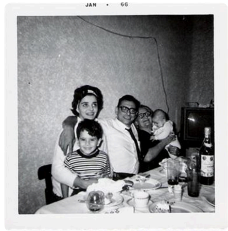
Trip to Spain....1966