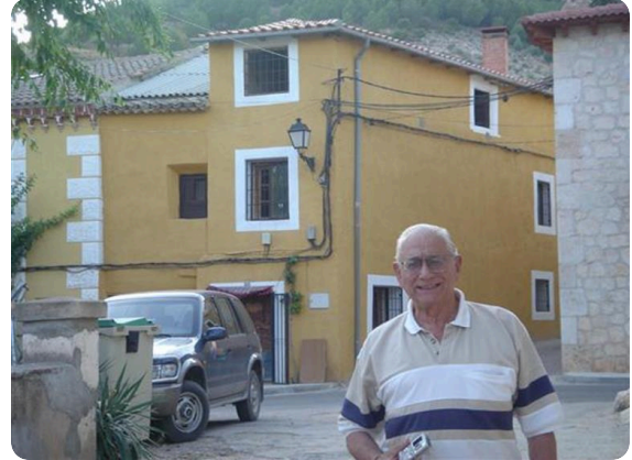
July 2006 in Romanones, Guadalajara, Spain