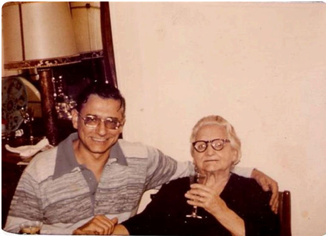
With his mother