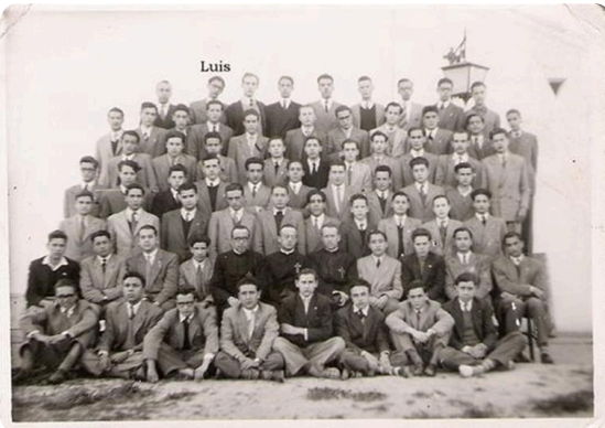
At school Madrid